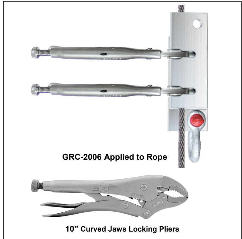
GRC-2006 Applied to Rope

Proceed with standard test procedures. After completing test, remove clamp and inspect cable for damage or kinks.